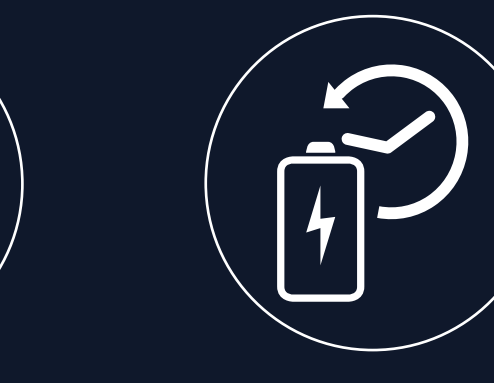
6000mAh Endure 7 hours