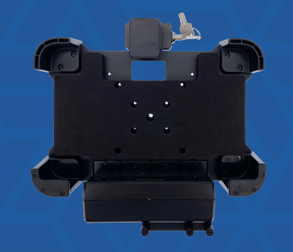
Vehicle Mount (Optional)

* The technical specifications of this product are subject to change without prior notice