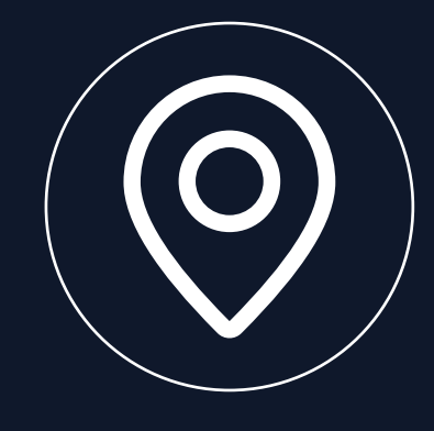
GPS/Glonass/Beidou IP65 protection level