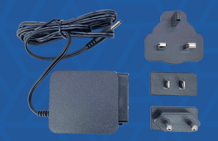
5V3A Adapter (Standard)