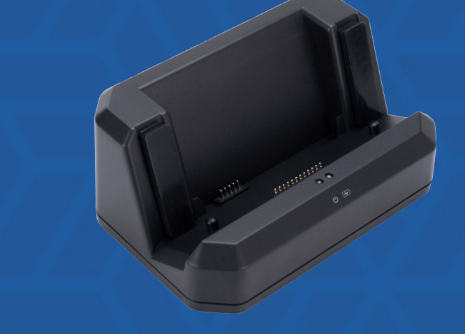
Docking Charger (Optional)