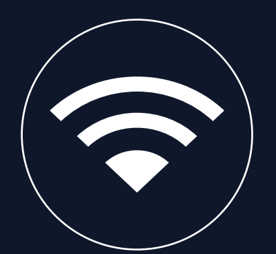
Dual-band Wi-Fi /BT 5.2/4G 8GB RAM 128GB ROM